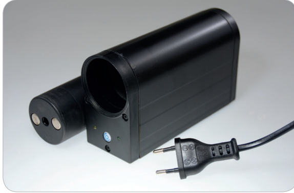
C3/4-CHG-01-XX-XX: NiMH charger with built in power supply

Before the system may be used, the battery must be charged using the accompanying charger. It takes 5-8 hours to fully charge a battery.