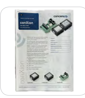
icon docs. in hard copy Starter-Kit/conXion-Installation Guide/icon-User Manual