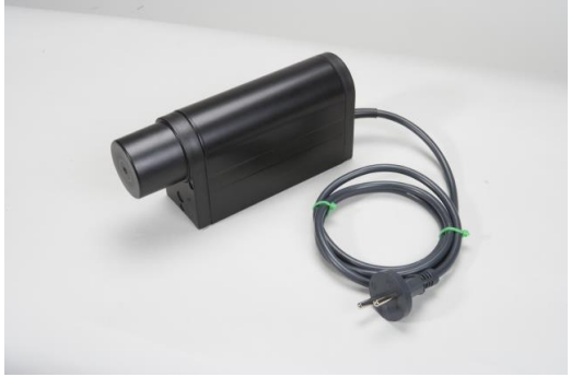
Battery mounted in charger

Before the system may be used, the battery must be charged using the accompanying charger. It takes 5-8 hours to fully charge a battery.