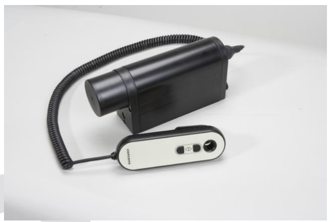
Battery mounted in the controller - ready for use

When the battery requires recharging, transfer it to the charger as described above. It is recommended that you keep an extra battery on hand to avoid disruption to operation.